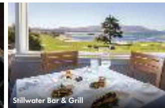
Stillwater Bar & Grill