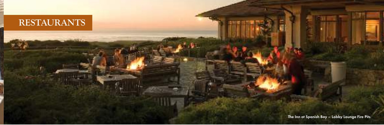
The Inn at Spanish Bay – Lobby Lounge Fire Pits