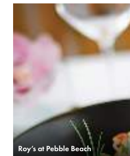
Roy's at Pebble Beach

Stave Wine Cellar | Wine tasting, retail & small bites N R