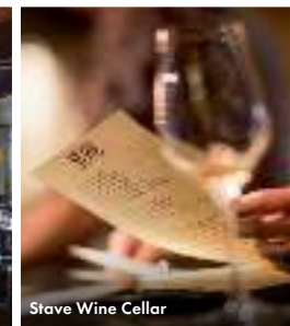
Stave Wine Cellar