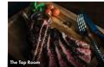
The Tap Room

Pebble Beach Market | Gourmet deli & wine shop B | L